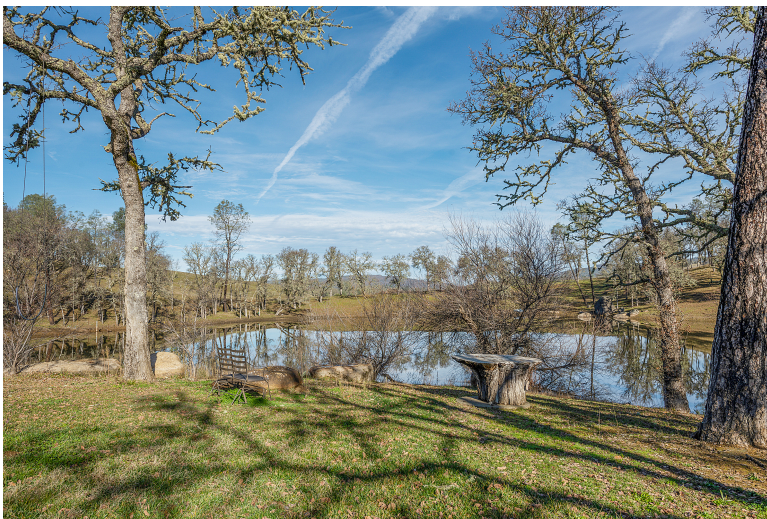
Lake. 12 Acre feet