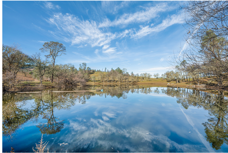
Lake. 16 Acre feet