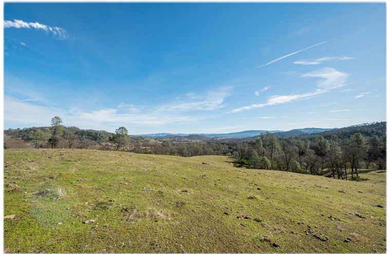
Three View Building Sites