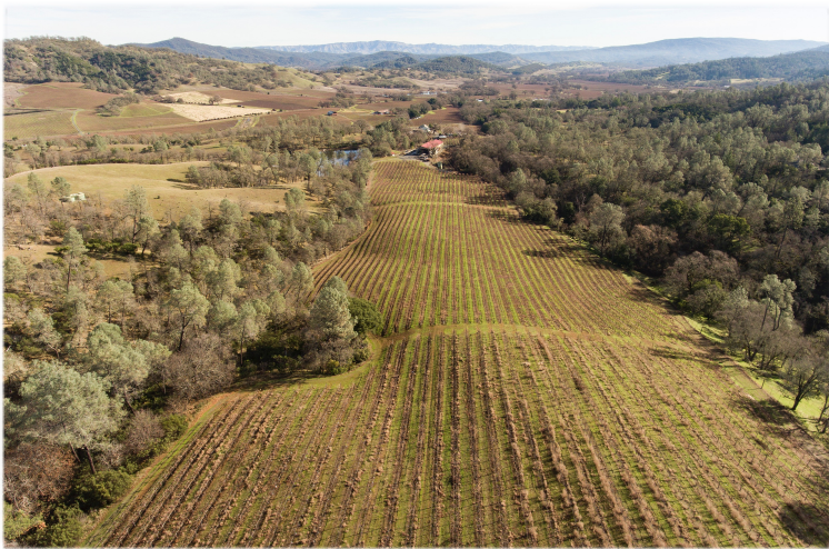
19 Acres Planted. 16 Plantable.