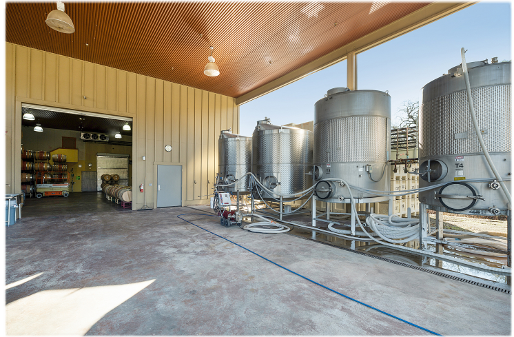
Stainless Steel Fermenting Tanks